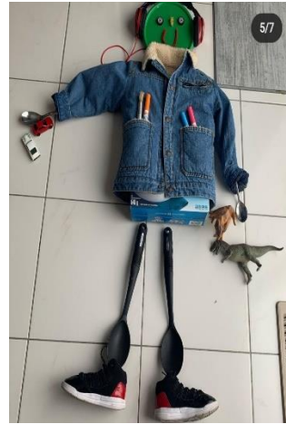
Example of a Self Portrait for Thursday's Art activity